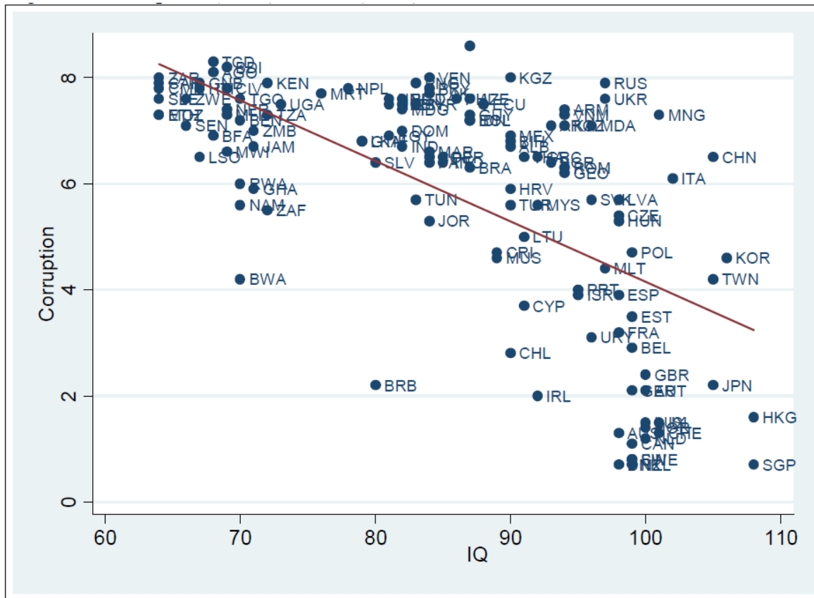
Correlation coefficient: -0.63. Source: Transparency International (2010) and Lynn and Vanhanen (2006)