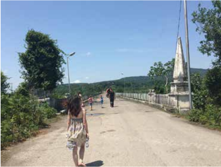
The Enguri bridge

Gali can obtain Abkhaz passports only through naturalization, and the procedure is discriminatory, arduous, and arbitrary. The process comes with the additional emotional burden of renouncing their Georgian citizenship, and doing so with a hand-written declaration that is considered invalid by the Georgian state.