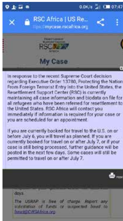
The new update regarding resettlement case status on the RSC website.

Refugee-hosting states and the UNHCR also experience such contingency. Their actions, such as the decision to keep Nyarugusu open and build the infrastructure to support massive resettlement, depended on U.S. governmental decisions. Refugee assistance, despite UNHCR pleas for international responsibility and burden sharing, continues to be state-centered and therefore contingent. The contingency itself is nothing new.