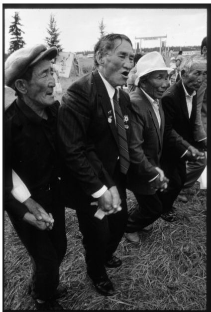
Figure 3. An ohuokhai master singer weaving his artistry.