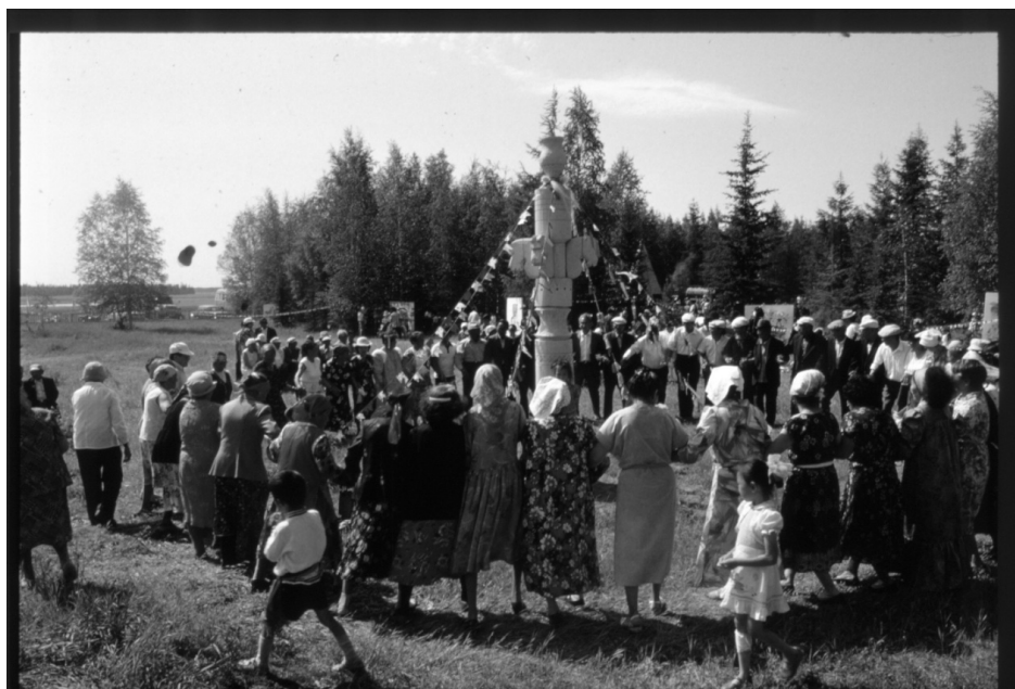
Figure 2. Dancing ohuokhai at a contemporary yhyakh festival.

Ohuokhai is a circle dance (Figure 2). Participants step left foot forward and right foot back, moving in a clockwise direction with fingers interlocked. The song leader poetically weaves his or her thoughts into sung appeal, energizing the circle's rhythm with