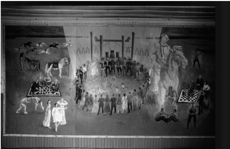
Figure 4. The mural in the Elgeei National School.

See the larch tree, how it grows, Hear how the cuckoo sings, "kere," And the lark, how it sings, And all the other bird songs, To the green pasture,