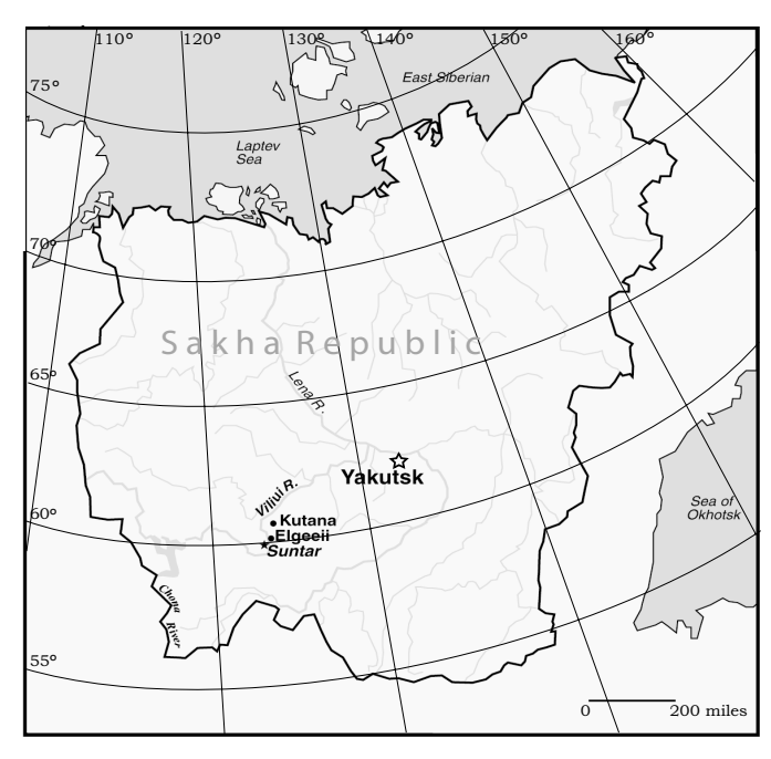
FIG. 1. The Sakha Republic, showing the capital city, Yakutsk, the Viliui River, the base research villages, Elgeeii and Kutana, and the Suntar regional center.

The existing efforts to investigate indigenous sustainability in the Russian North have no aspect of working within local communities specifically to define sustainability (Krupnik, 1993; Pika, 1999; Jernsletten and Klokov, 2002). Local investigation is a crucial step. By working within communities and discussing what they and the coming generations need for a sustainable future, it should be possible to see what aspects of contemporary life do and do not work. The investigative process should also clarify the obstacles to achieving local definitions. The case reported here is an attempt to test this research approach.