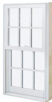
Figure 1. Double hung window

The building’s windows are double-hung, Figure 1. The double-hung window consists of an upper and lower sash that slide vertically in separate grooves in the side jambs. This type of window provides a maximum face opening for ventilation of one-half the total window area. Each sash is provided with springs, balances, or compression weather stripping to hold it in place in any location.”