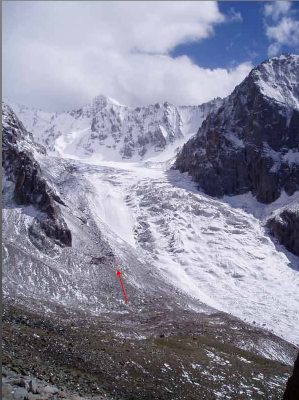
View of Trail to Korona, Izyskatel' and Free Korea (On Left Side) Skirting Ak-Say Ice Fall