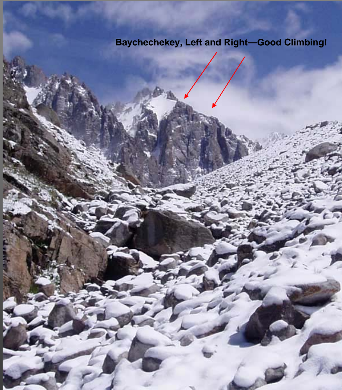
View of Baychechekey from Base Camp