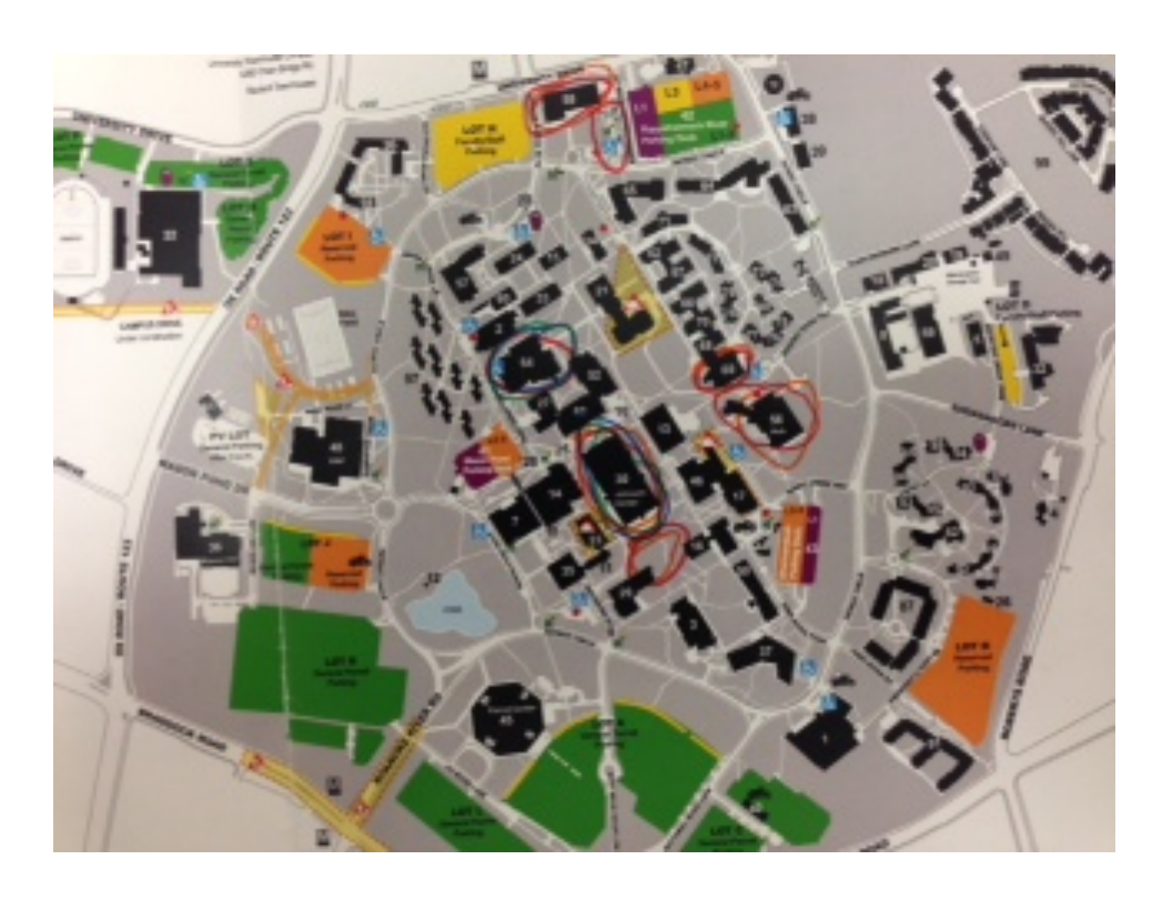
Figure 1. Fairfax campus map displaying a participant's answers to questions "Where do you see diversity?" – red marker, "Where do you spend your time" – green marker, "Where do you feel comfortable?" – blue marker, and "Where do you see people from diverse/different groups interacting?"- yellow marker.